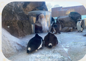
Penguins and Santa National Aviary