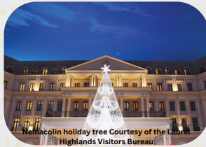
Nemaocolin holiday tree