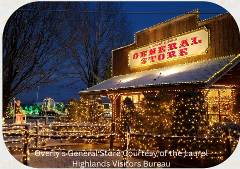
Overly's General Store