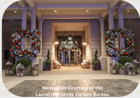
Nemaocolin Courtyard of the Laurel Highlands Visitors Bureau