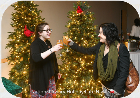
National Aviary Holiday Late Nights