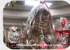
Philadelphia Candies, Mercer County