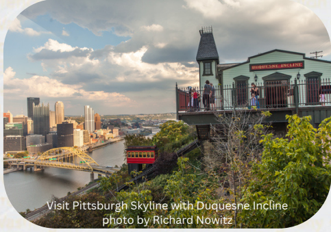
Visit Pittsburgh Skyline with Duquesne Incline