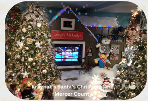
Santa's Christmas Shop Mercer County