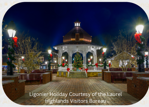
Ligonier Holiday Courtyard of the Laurel Highlands Visitors Bureau