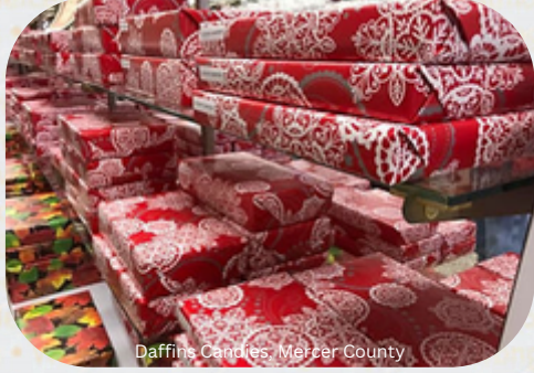
Daffins Candies, Mercer County