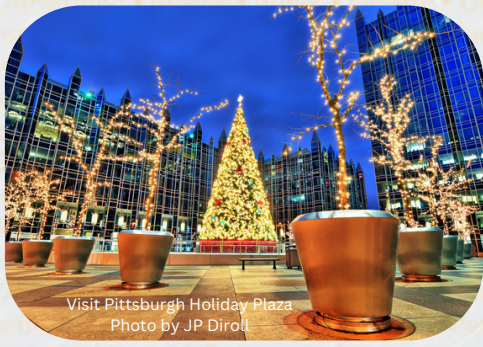
Visit Pittsburgh Holiday Plaza