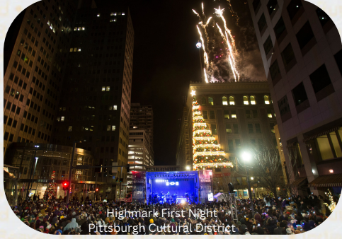
Highmark First Night Pittsburgh Cultural District