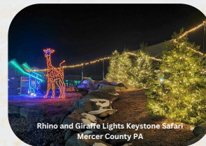
Rhino and Giraffe Lights Keystone Safari Mercer County PA