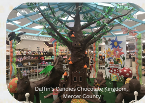
Daffin's Candies Chocolate Kingdom, Mercer County