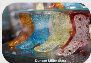
Duncan Miller Glass