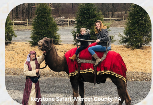
Keystone Safari, Mercer County PA

Personalize your itinerary by substituting suggested sites with any DGP member stop. Visit DestinationGreaterPittsburgh.com to explore.